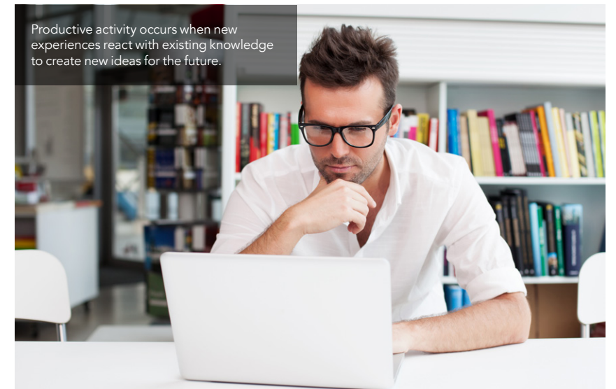
Productive activity occurs when new experiences react with existing knowledge to create new ideas for the future.

Walia suggests that to understand creativity dynamically, all the elements of the creative act need to be taken into account. Based on the